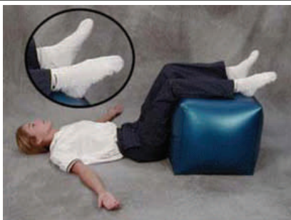
Static Back Point/Flexes