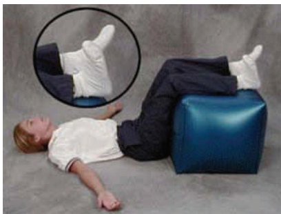
Static Back Foot Circles